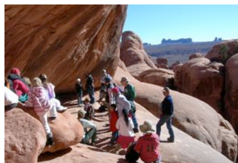
The Arches National Park October hike was a hit. The weather was beautiful and learning plentiful.