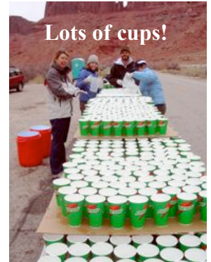
Lots of cups!