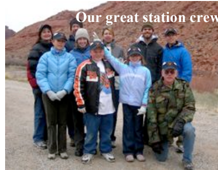
Our great station crew