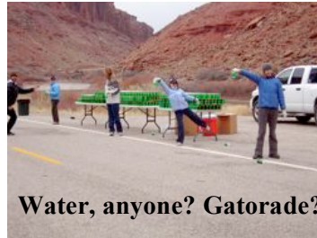
Water, anyone? Gatorade?

To the race organizers: thank you for your generous donation of $400 to Grand Area Mentoring. Sorry we forgot the aid station sign on course. Next time we'll do better! We look forward to working with you again.