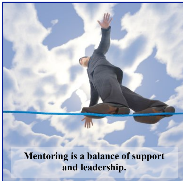
Mentoring is a balance of support and leadership.

Part of being an effective mentor is having the confidence and perseverance to lay out some sensible ground rules that you and your mentee will follow. Even if you haven't done so already, it's never too late to clearly explain the rules to your mentee and why they are necessary.